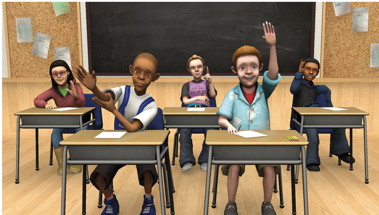
Figure 2 TeachLive Interface